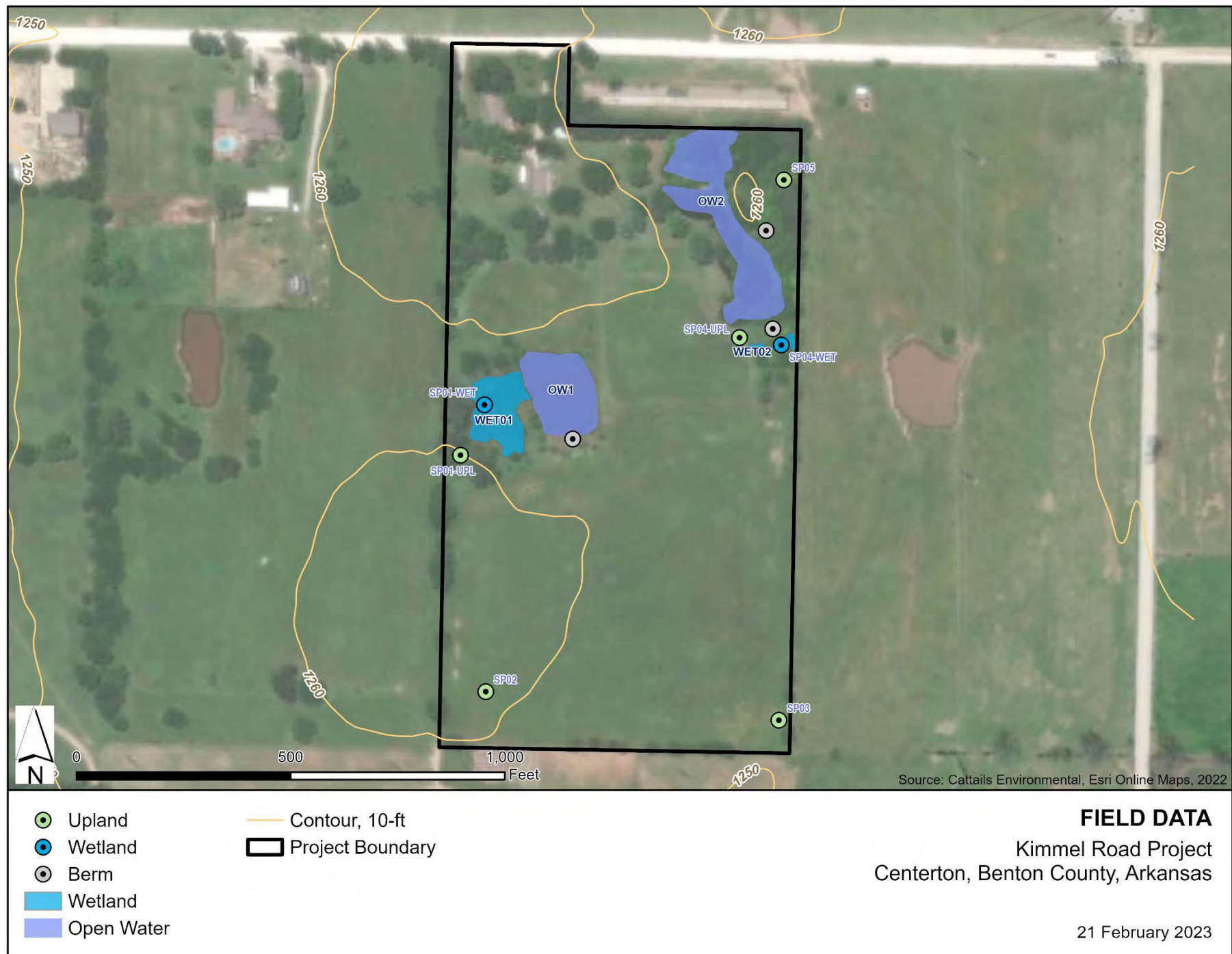
Figure 1-2. Field Data map for the Kimmel Road Project, Centerton, Benton County, Arkansas.