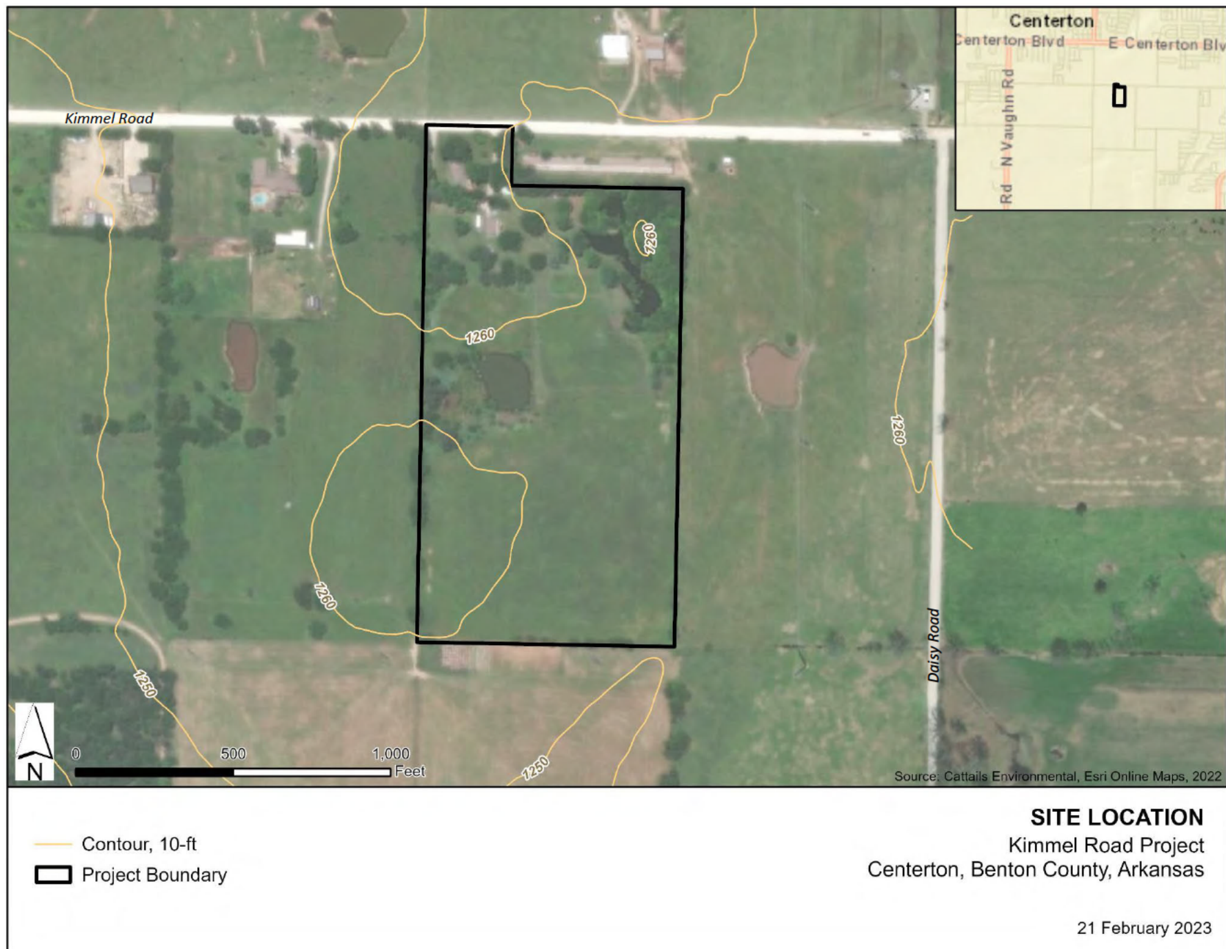
Figure 1-1. Site Location map for the Kimmel Road Project, Centerton, Benton County, Arkansas.